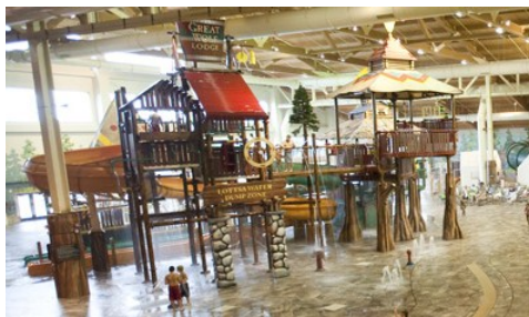
Fort Mackenzie at Great Wolf Lodge Waterpark

We have another opportunity for a family overnight at Great Wolf Lodge. This year would be a little different though than last. We would reserve 20 rooms, and it is for one night only. The date would be Sept 2nd, which is the Friday of Labor Day weekend.